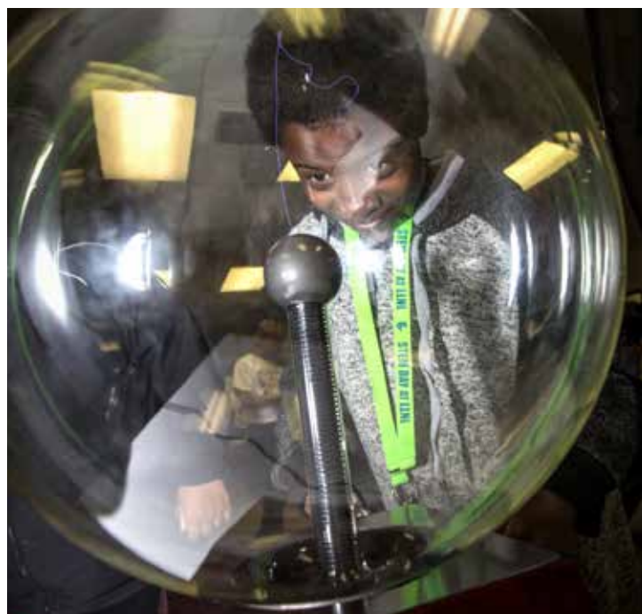
During STEM Day at the Laboratory, interactive exhibits include a plasma globe (shown above), a bicycle that generates electricity, and three-dimensionally printed objects.