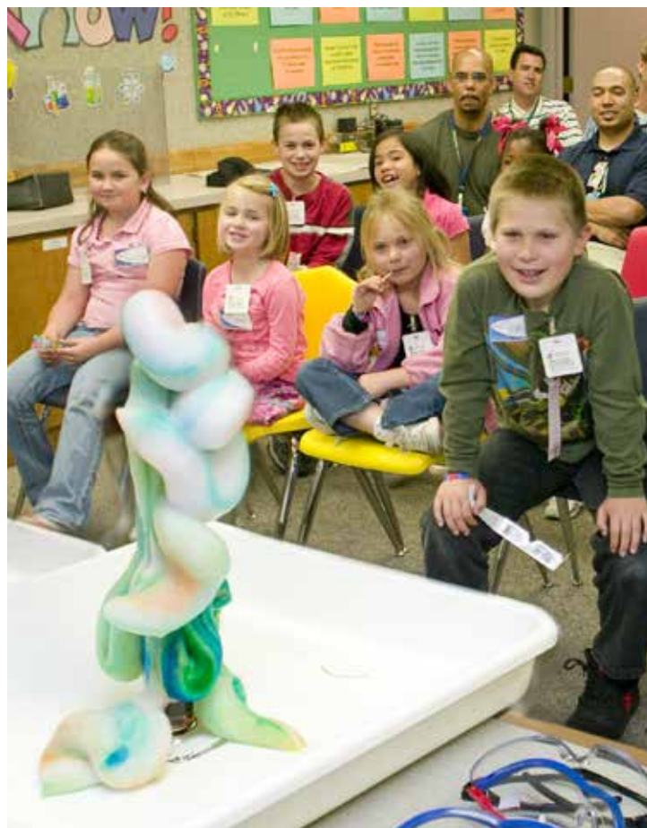
In an experiment that illustrates basic chemistry concepts, hydrogen peroxide reacts with dish soap and potassium iodide to create “elephant’s toothpaste.”

In Level I, teachers build introductory skills and knowledge in their chosen discipline. In Level II, participants receive more days of instruction with a deeper topical dive. Level III includes job shadowing and preparation for the eight-week mentored internship of Level IV, in which teachers can contribute to real-world problems and publish their work. Albala says, “If you